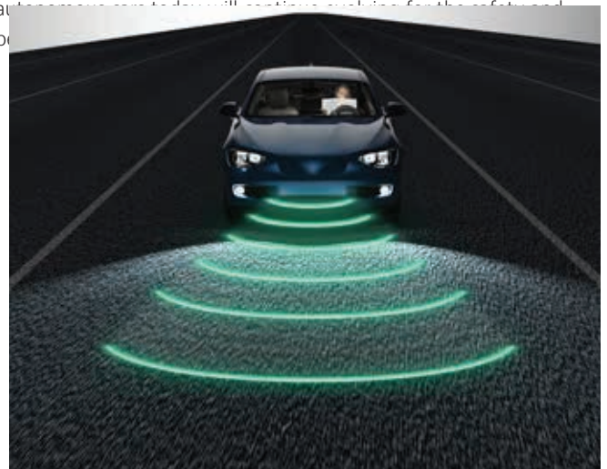
Illustration of Autonomous Vehicle with LiDAR System

Advanced filtering technologies that are successfully guiding semi-autonomous cars today will continue evolving for the safest and most