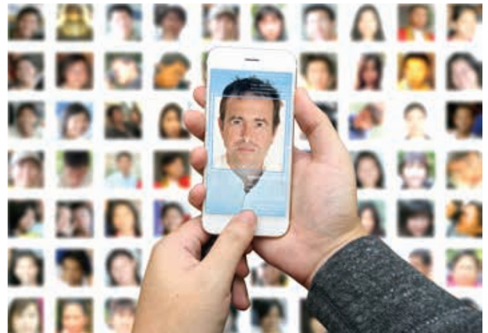
A multitude of sensors enable conceptual facial recognition technologies

necessary, ensure you stay awake and attentive.